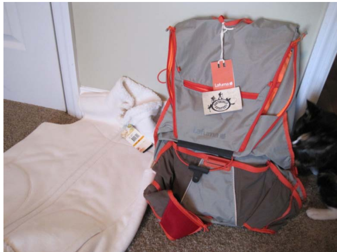
Just a few useful items (kitten nosy but not included)